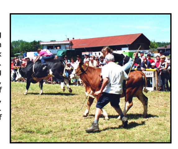
Beating ox to make it run

As part of an ongoing campaign we have been tracking and monitoring Ox racing in Bavaria, Germany. It involves transporting bullocks around the country, which causes a great deal of stress, as does the riding, racing and beating of them. We have made a number of complaints.