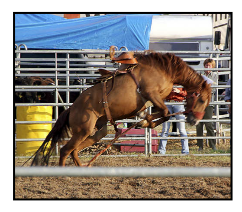
Dangerous loose head rope

Although, the flank strap has been banned, due to the work of FAACE in cooperation with INITIATIVE ANTI- CORRIDA, Germany, there are still ongoing problems, such as the loose head rope that is dangerous for the horses.