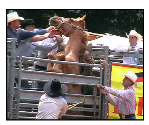
Horse rearing in chute

We also work with groups in France, as the rodeos travel from Germany to France where the cruelty is even more out of control due to lack of supervision.